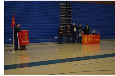
Company staff conducting awards ceremony for Westview High School MCJROTC on April 22 nd .