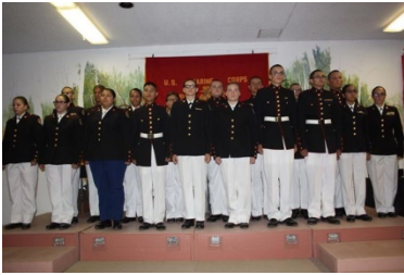
Cadets from Ray High School Marine Corps JROTC, in Kearny, Arizona, stand at attention during their final awards ceremony.