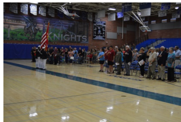
Presenting of the Colors to start the Westview High School MCJROTC unit's awards ceremony on April 22 nd .